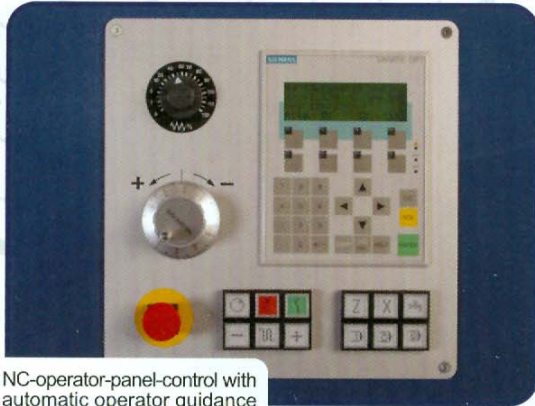
NC-operator-panel-control with automatic operator guidance