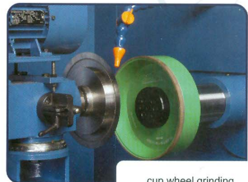
cup wheel grinding